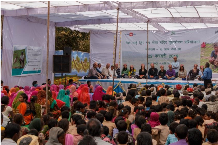
Community meeting with MakeMyTrip team in Patiya village – Badgaon block