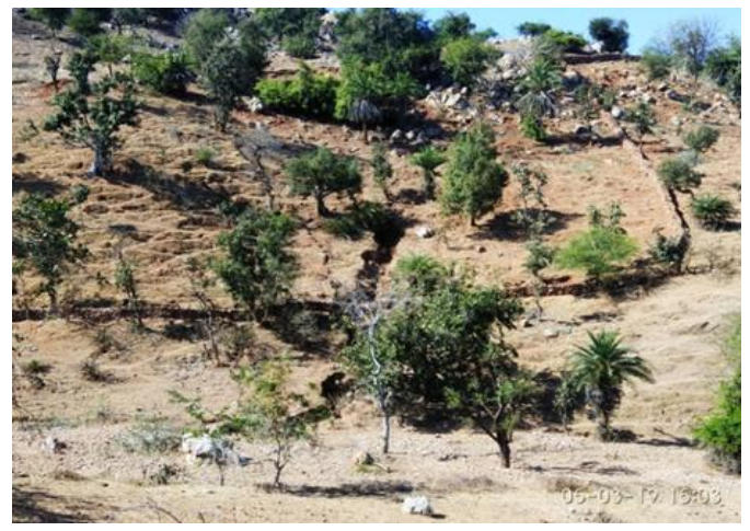
Proposed site of Khuntwada pastureland (Kherwara block)