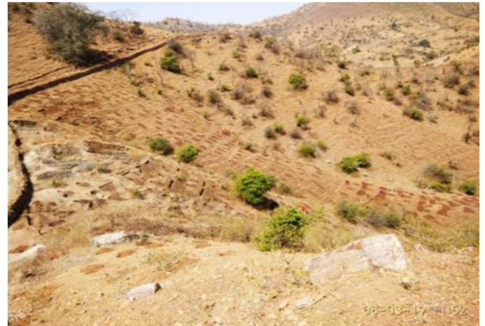
Soil & water conservation measures and pit digging works completed in Patiya II common pastureland (Badgaon block)