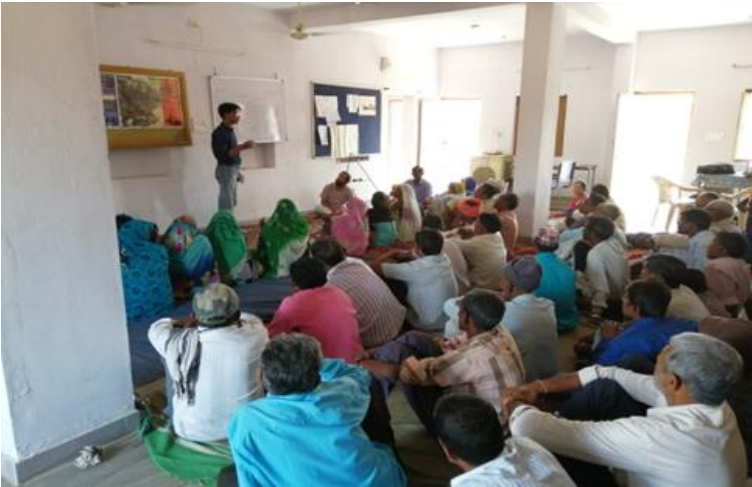
Orientation of individual beneficiary farmers for plantation activities on private land