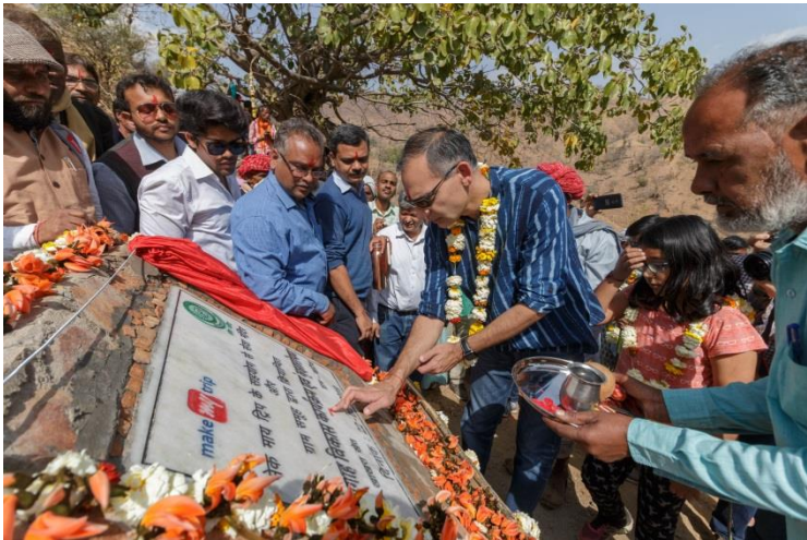
Unveiling project foundation stone in Patiya village