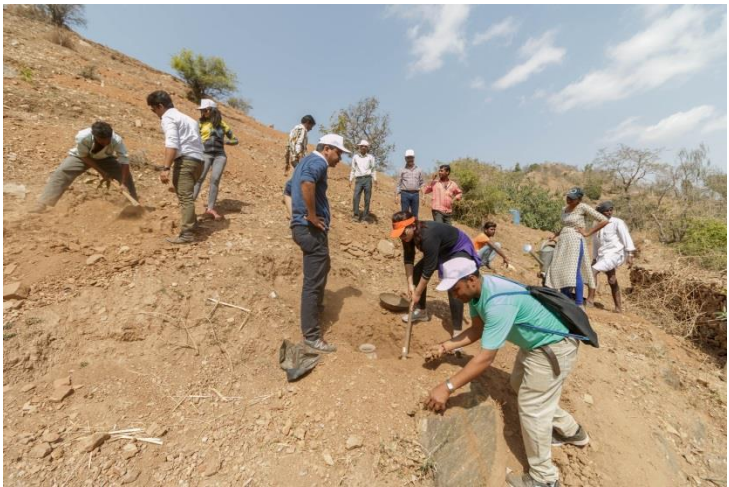
Plantation and installation of pitcher irrigation system /Ged system by MakeMyTrip Team