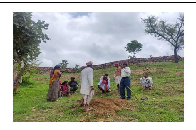
On-site orientation- Plantation