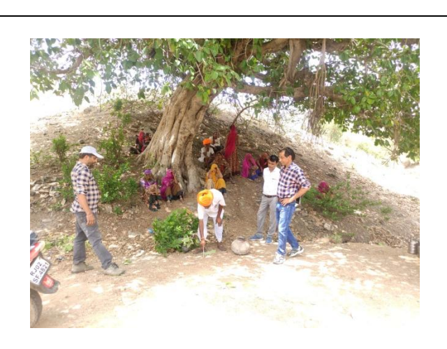
Pit digging training- Shobhawato Ki Bhagal