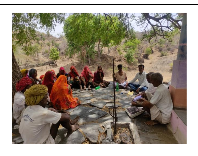
Community meeting- Rod ka Guda