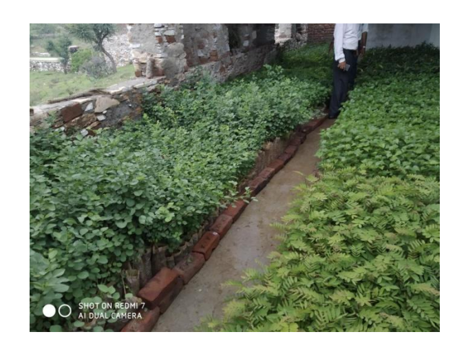
Nursery saplings reserved for plantation