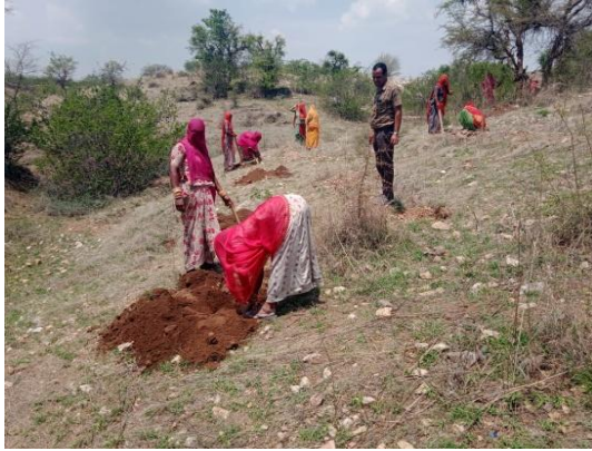
On-site demo cum orientation