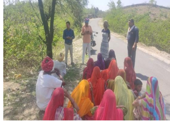
Community meeting cum orientation