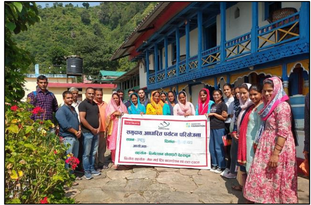
GUIDING TRAINING WORKSHOP IN THE MAKKUMATH CLUSTER