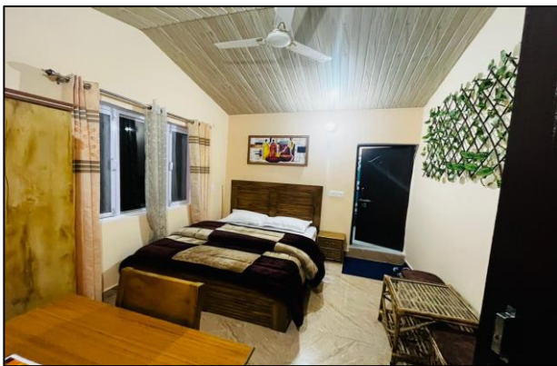
HOMESTAY READIED IN JADIPANI