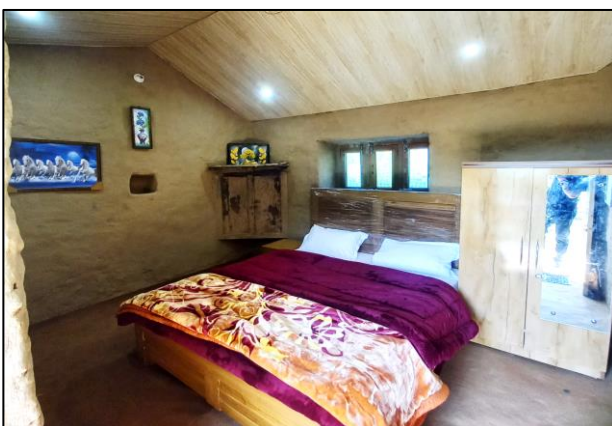
TRADITIONAL HOMESTAY DEVELOPED IN THE JADIPANI CLUSTER