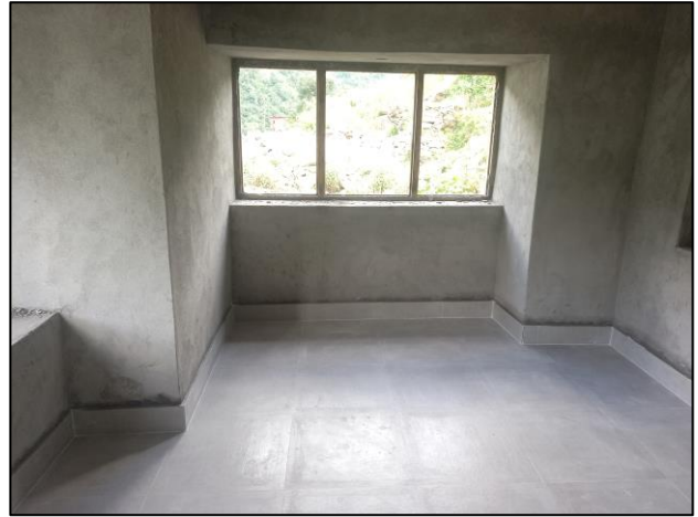
TILING WORK RESUMED IN THE HOMESTAYS COMPLETED IN THE MAKKUMATH CLUSTER