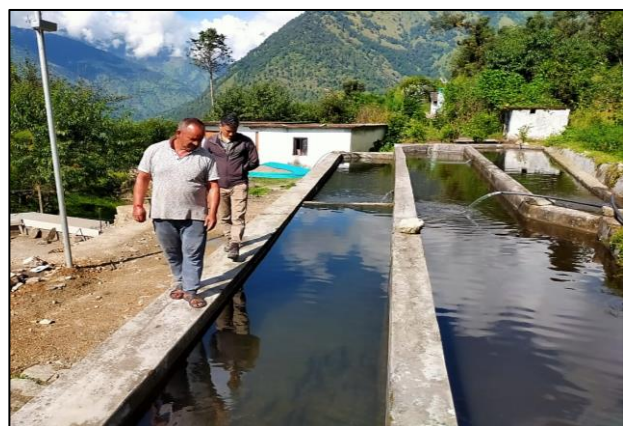
NEW SITES EXPLORATION FOR HOMESTAYS AROUND THE MAKKUMATH CLUSTER