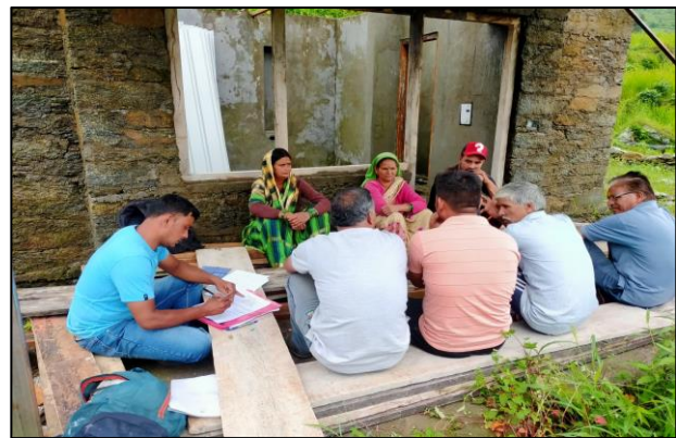
MEETING FOR BENEFICIARIES' CONTRIBUTION