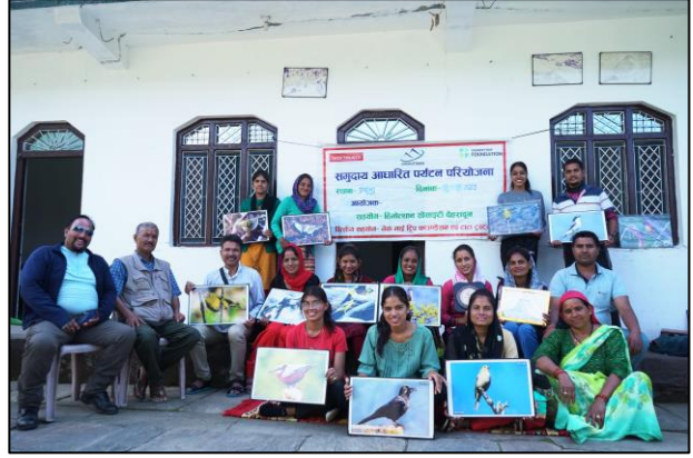
SPECIALIZED BIRDWATCHING TRAINING IN MAKKUMATH CLUSTER