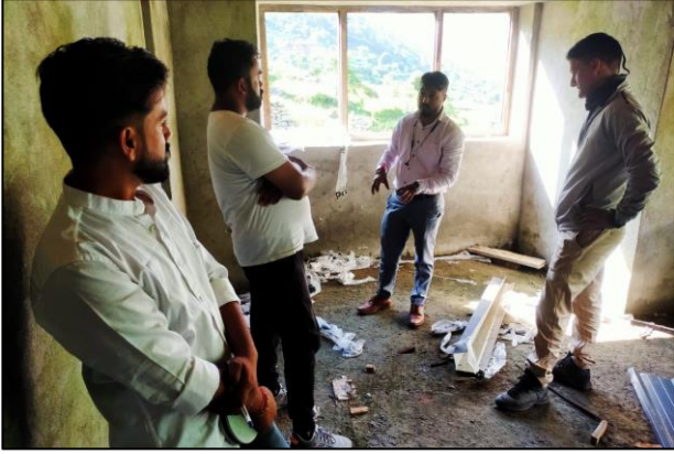
ON-BOARDING OF INTERIOR DEVELOPER FOR THE MAKKUMATH HOMESTAYS