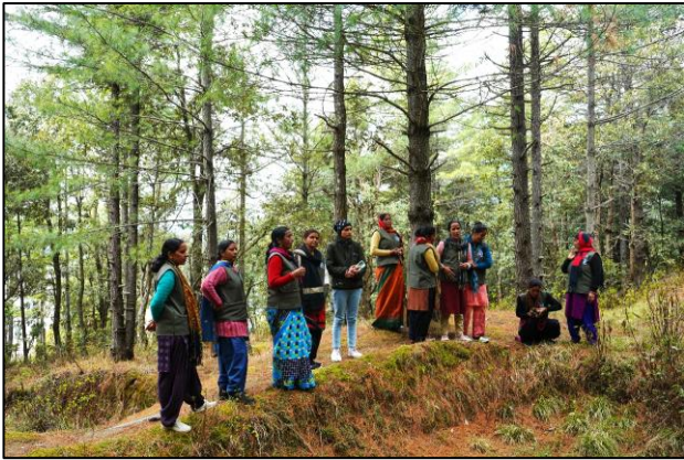
GUIDING GROUP ASSESSMENT RUN IN THE JADIPANI CLUSTER