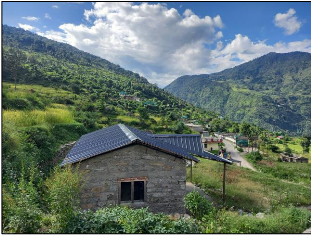
HOMESTAYS' ROOFS COMPLETED IN THE MAKKUMATH CLUSTER