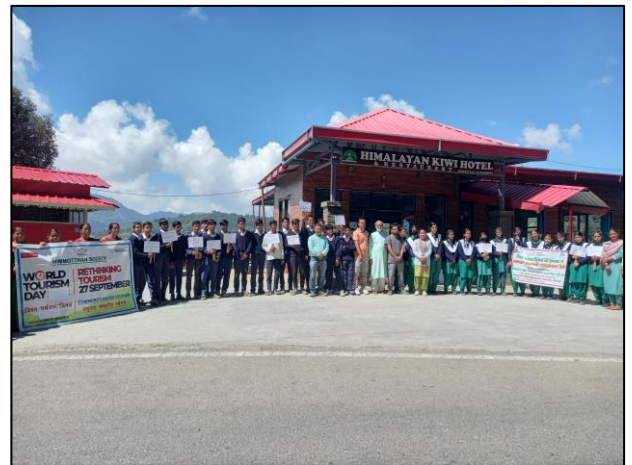
WORLD TOURISM DAY CELEBRATION WITH LOCAL SCHOOL & OPERATORS IN JADIPANI