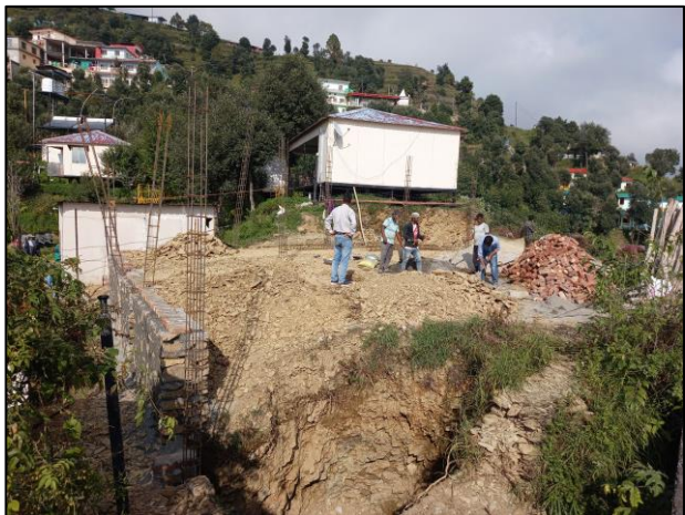
FOUNDATION WORK OF COMMUNITY CAFÉ IN THE JADIPANI CLUSTER