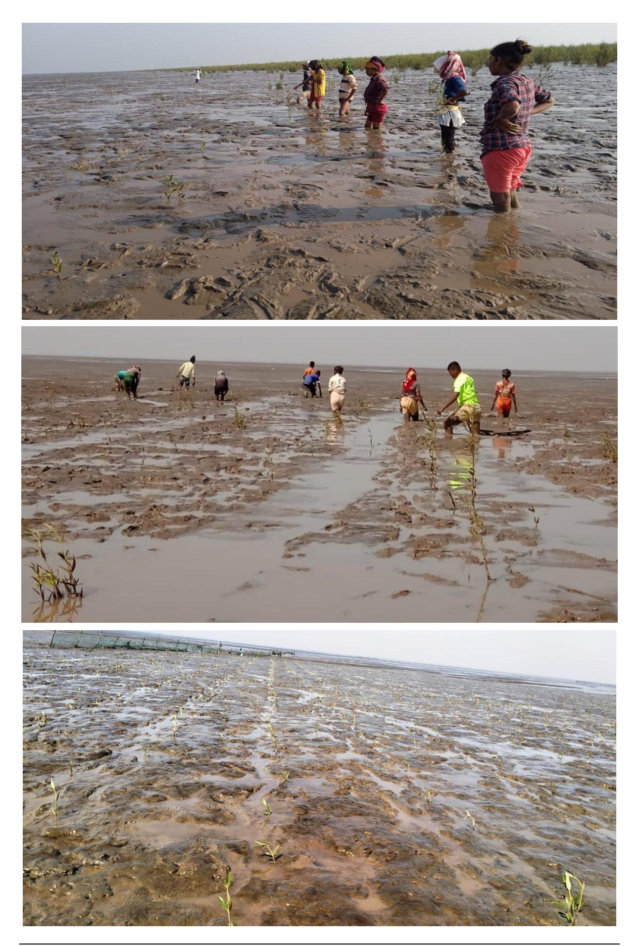
Project Supported by MMTF & Implemented by VIKAS Centre for Development