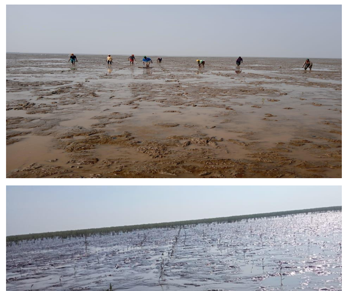
Project Supported by MMTF & Implemented by VIKAS Centre for Development