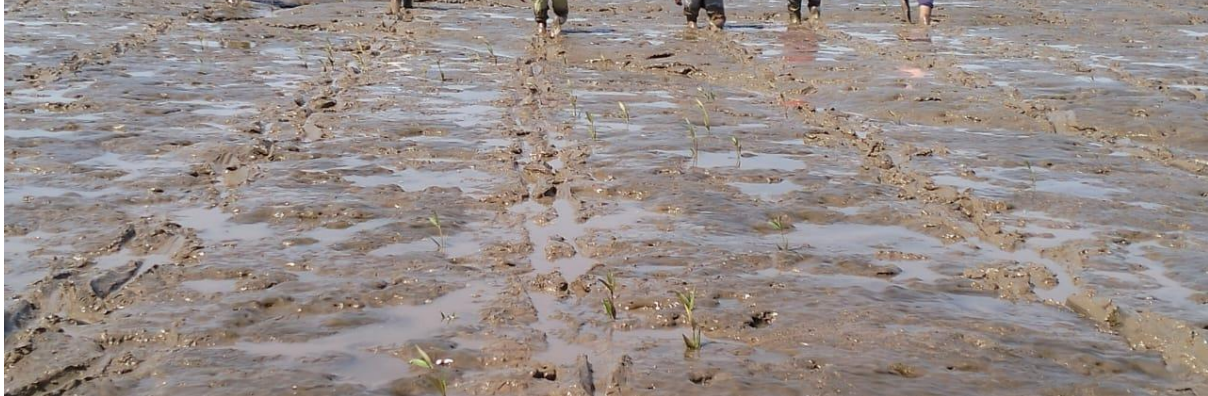
Project Supported by MMTF & Implemented by VIKAS Centre for Development