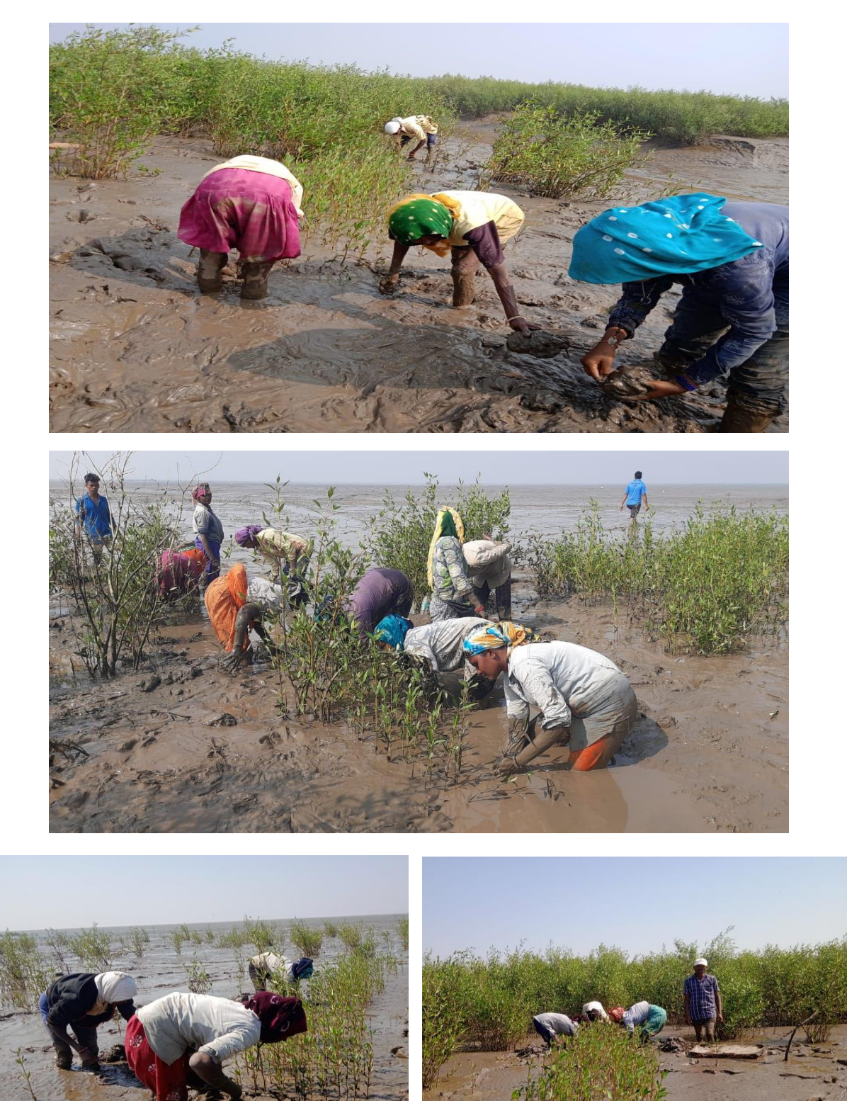
Project Supported by MMTF & Implemented by VIKAS Centre for Development

* Taking out the Plants from the Nursery for Plantation Work.