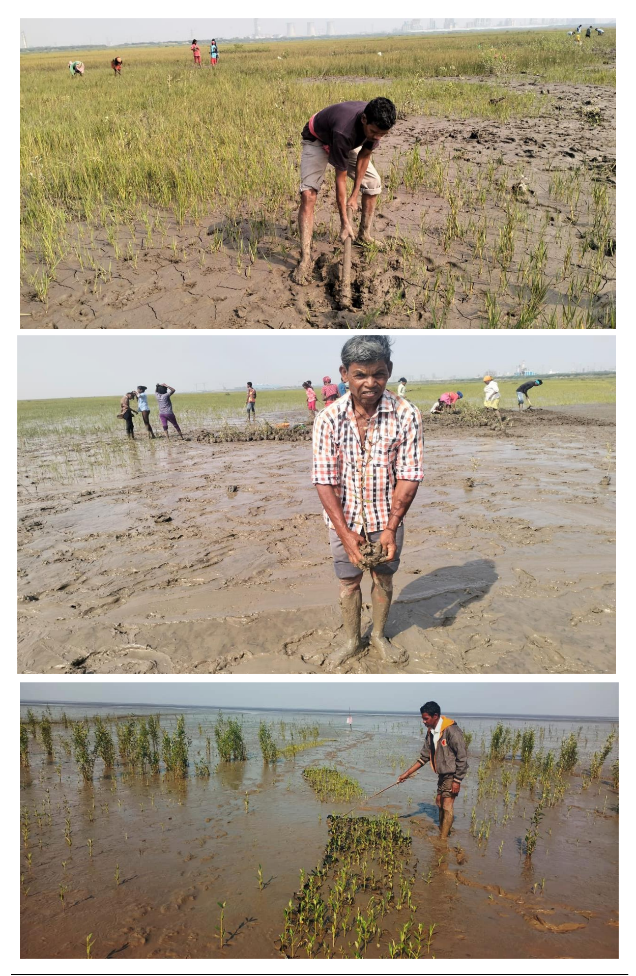
Project Supported by MMTF & Implemented by VIKAS Centre for Development