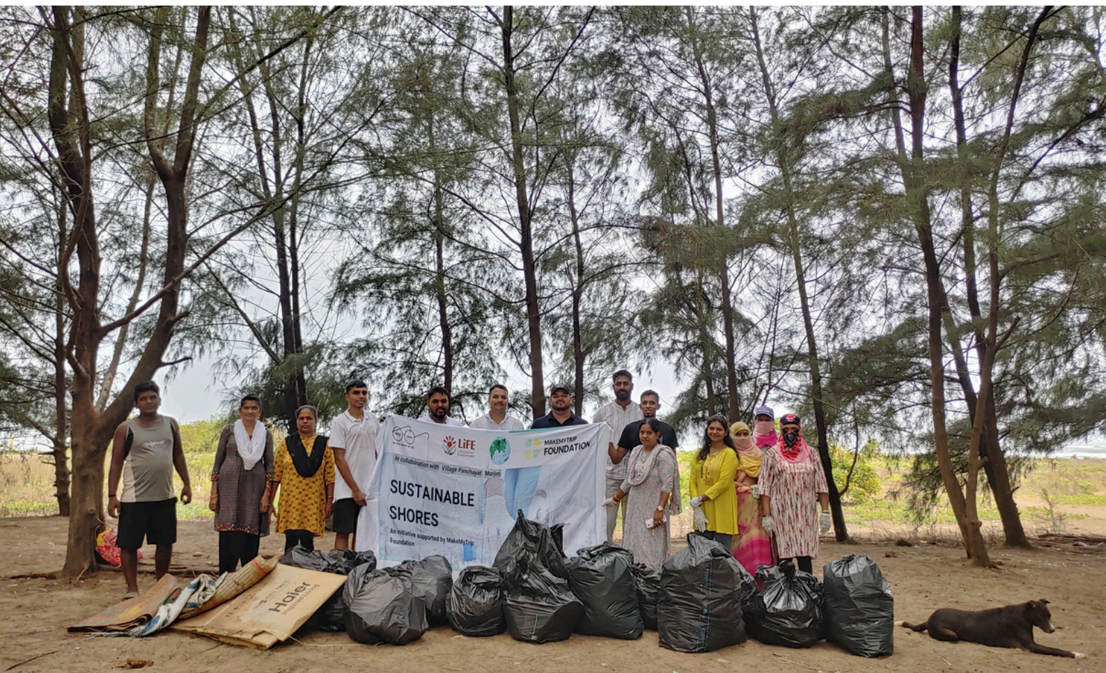
Clean-up drive at Morjim Beach