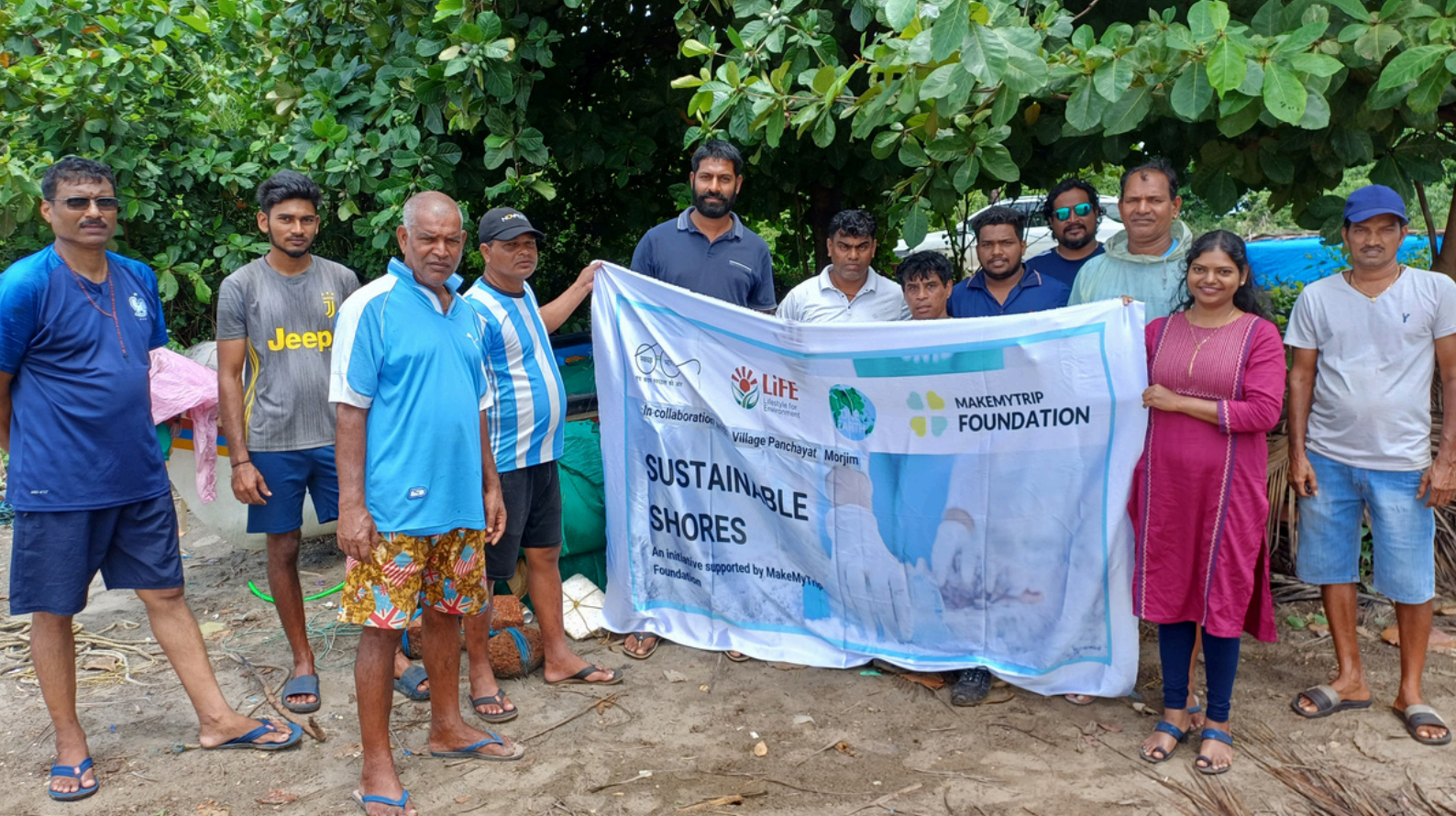
Workshop with fishing community in Morjim