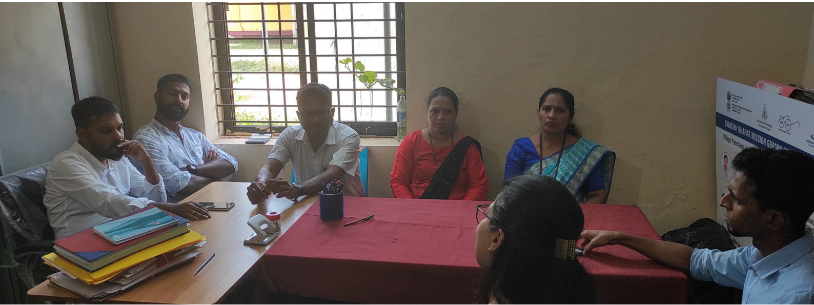
Meeting with Village Panchayat Morjim