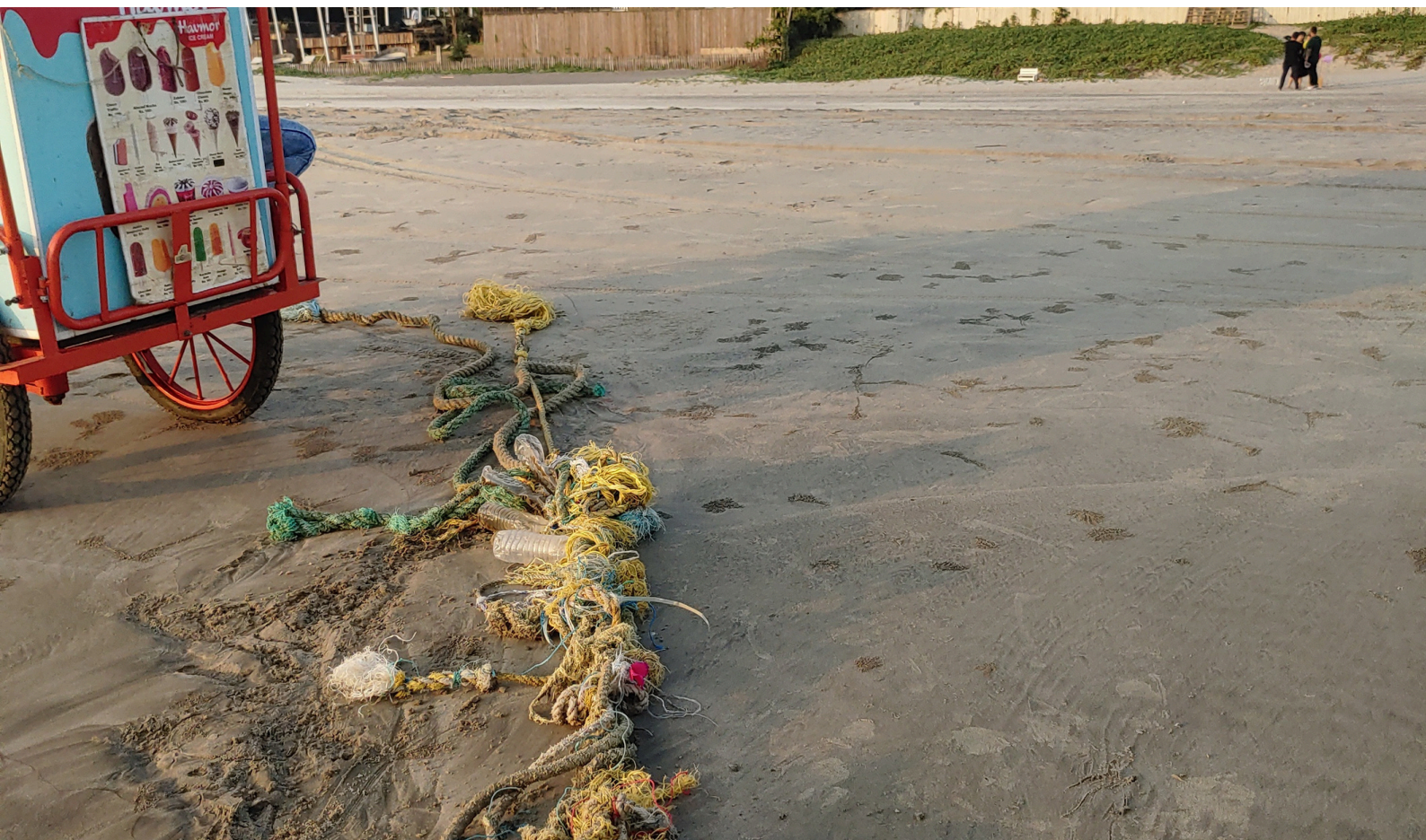
Discarded fishing nets and gears at Morjim Beach

The baseline survey was initiated in April and is currently in progress. It is scheduled for completion by the end of July. The data collected will provide valuable insights into the existing challenges and will help in measuring the impact of our interventions over time. By the end of June 2024, we were able to get 38 responses through online and offline surveys of various stakeholders. The survey results will guide our strategic planning and help us tailor our activities to address specific needs effectively.