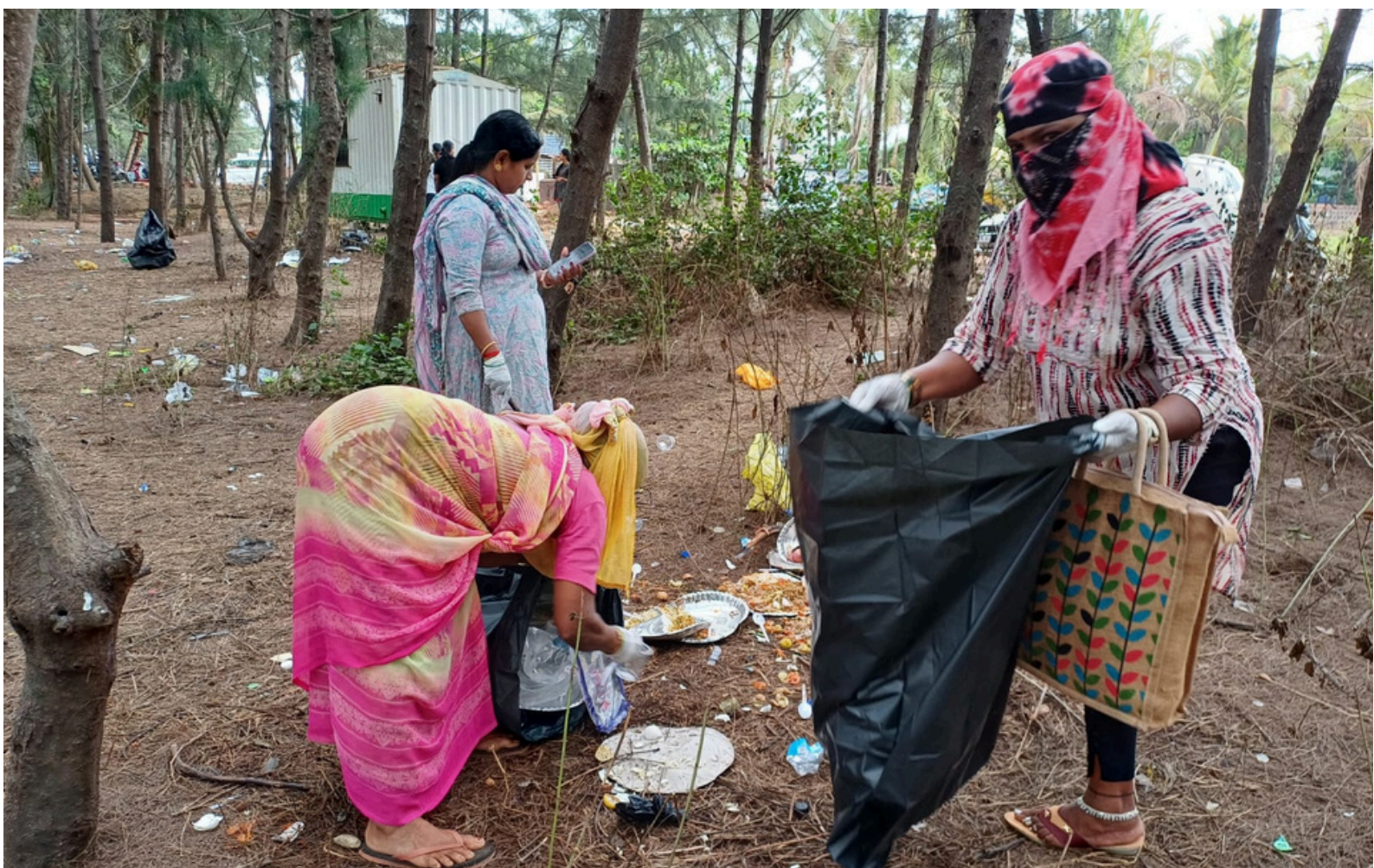
Clean-Up Drive at Morjim Beach

CEE, appointed by the Department of Drinking Water and Sanitation as the state lead for Goa under the Rural WASH Partners' Forum (RWPF), spearheads WASH and sanitation initiatives. CEE and OneEarth have collaborated to support the state government of Goa in initiatives under Swachh Bharat Mission SBM 2.0 and Jal Jeevan Mission JJM 2.0. The Sustainable Shores project will be monitored under these initiatives. Consequently, all our creative materials will feature the Ministry logo, CEE logo, SBM logo, and LIFE Mission logo.