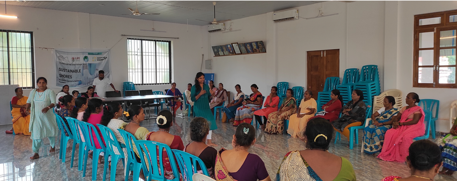
Awareness session with SHG group at Morjim

In June 2024, we commenced our community engagement and IEC (Information, Education, and Communication) activities for the Sustainable Shores project. These initiatives aimed to introduce the project, highlight its significance and educate the community on the importance of proper waste management, especially in coastal areas.