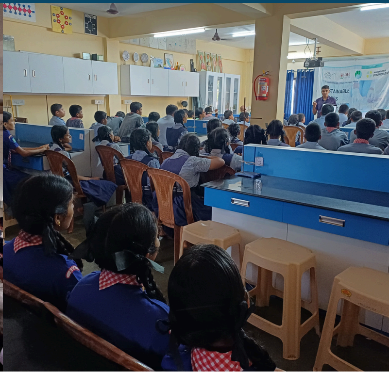
Awareness sessions in schools